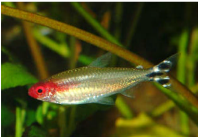
RUMMYNOSE TETRAS (HEMIGRAMMUS BLEHERI)

There are many schooling fish available in the aquarium trade these days but few school better than the incredible Rummynose Tetra. We hear it all at Tideline – rummynose tetras, nascar tetras (checkered flag tails)! But really, these are a beautiful addition to the community aquarium. While there is some captive breeding going on with this fish, the majority of them are still collected from the Amazon River in South America. These fish often arrive to us thin and in poor condition. We beef them up with a little medication and a mixed diet of flake foods, bloodworms and brine shrimp. Within about a week of arriving, these fish are fully conditioned and coloring up nicely. We suggest keeping them in groups of five or more. The group travels about the tank together and within a few days of being added to your aquarium, the color begins to intensify. Once fully established, rummynose tetras will rival the color of even a neon or cardinal tetra. To keep these guys healthy, give them soft, warm water (about 78-84 degrees) and a mixed diet as suggested above. If you have never kept this fish, use the website coupon this week and give them a try – you will not be disappointed! This is just one of the coupon specials this week at: www.tidelineaquatics.net