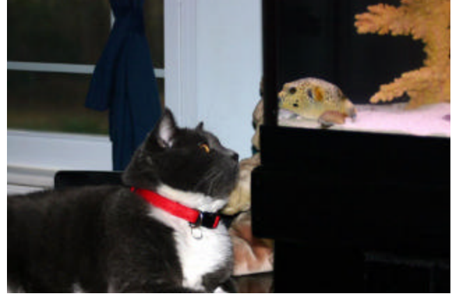
A friend? Or is the kitty just hungry??

If you have some good photos of your fish, reef, pond or aquarium, please email them to the webmaster at: chris@tidelineaquatics.net