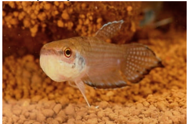
A RARE MOUTH-BROODING BETTA W/ EGGS!!

Seeing photos of these mouth-brooding fish can be striking but to actually be able to watch a pair of fish spawn and raise fry in your own home aquarium tops the cake! During your next visit to the store, let us help you select a mouth-brooding species that will coexist with the fish you have in your aquarium.