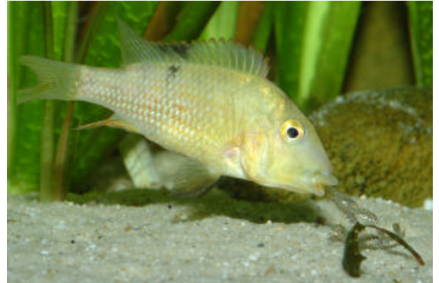
FEMALE GEOPHAGUS RELEASING HER BABIES FROM HER MOUTH FOR A QUICK SWIM.

The parenting skill of mouth-brooders is something no hobbyist should miss. The fish carrying the eggs may not even eat for 9 days or more! If you want a chance to view this in your own aquarium, here are some of the more likely candidates that often spawn in captivity when kept in pairs: Red-Hump Eartheater ( Geophagus steindachneri – freshwater), Mbuna African Cichlids ( Pseudotropheus sp., Melanochromis sp, Labidochromis sp., Labeotropheus sp. – freshwater), Peacock Cichlids ( Aulonocara sp. – freshwater), Kauderni Cardinalfish ( Pterapogon kauderni – saltwater).