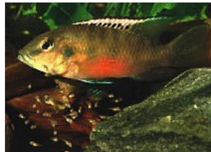
WEST AFRICAN CICHLID RELEASING FRY FROM HER MOUTH AND GILLS.

The parenting skill of mouth-brooders is something no hobbyist should miss. The fish carrying the eggs may not even eat for 9 days or more! If you want a chance to view this in your own aquarium, here are some of the more likely candidates that often spawn in captivity when kept in pairs: Red-Hump Eartheater ( Geophagus steindachneri – freshwater), Mbuna African Cichlids ( Pseudotropheus sp., Melanochromis sp, Labidochromis sp., Labeotropheus sp. – freshwater), Peacock Cichlids ( Aulonocara sp. – freshwater), Kauderni Cardinalfish ( Pterapogon kauderni – saltwater).