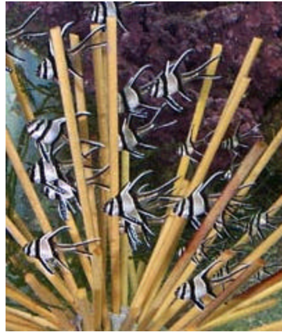
BABY KAUDERNI CARDINALFISH SWIMMING AMONG TOOTHPICKS IN CORK!

Once the fry are fully formed, he releases them from his mouth. Because the young are so small and vulnerable, they swim among the sharp spines of the Long Spine Sea Urchin. In the aquarium, placing wooden toothpicks into a piece of foam or cork can mimic the urchin's spines. The baby cardinalfish school into the toothpicks and will feed there until they grow larger.