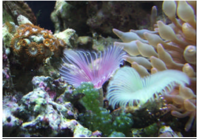
ANDREW AND SAM'S BEAUTIFUL TUBE WORMS

If you have any photos of your aquarium or garden pond, please email them to: