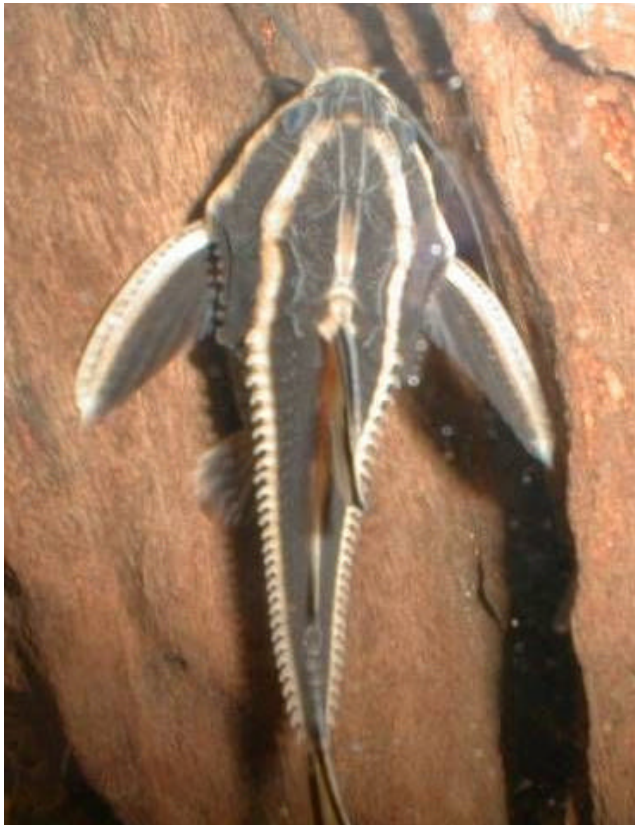
STRIPED RAFAEL CATFISH HAPPILY WEDGED IN DRIFTWOOD.

ponds or large aquaria for growing out to a sellable size. These fish live in close quarters with little decorations. Many wild collected fish however, have lived their lives in a more natural environment and can suffer from being placed with just an open aquarium. Wild collected catfish, for example, are often found in areas with dark water and roots as many are nocturnal species. Generally in the aquarium, one uses activated carbon and strong lighting for viewing your animals. To give these wild caught catfish some comfort, one might use stacks of natural rock and driftwood roots where these fish can seek refuge during the daylight hours. By giving them these familiar hide outs, they will be less stressed. Over time, they will become more accustomed to the brighter lighting and stray about the aquarium as they would have in the dark waters of the wild.