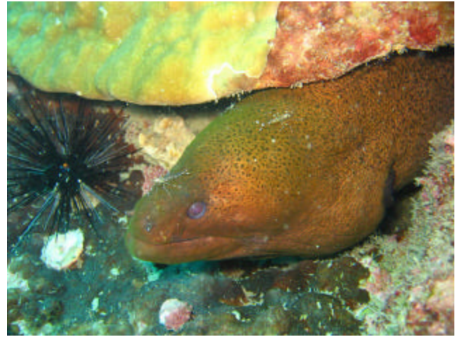
A COMFORTABLE MORAY EEL UNDER A CORAL LEDGE

crevices tend to find a place to hide and be less likely to jump to their death.