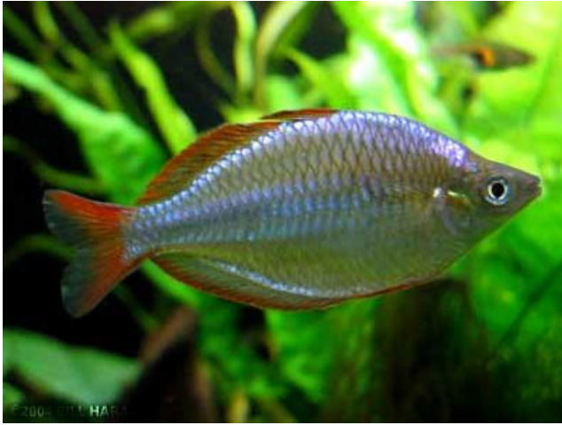
THE DWARF NEON RAINBOWFISH (MELANOTAENIA PRAECOX)

There are many colorful rainbowfish available in our hobby these days but most grow to 5" or more in size making them too large for smaller aquariums or even in tanks with small, schooling fish. The Neon Praecox Rainbowfish is the exception. This rainbow is often referred to as the Dwarf Rainbowfish. Reaching only about 3" at full size, these fish are peaceful even with size challenged fish like neons, cardinals and rasboras. The males and females are easily distinguished by the color of the fins. Pictured above is a male displaying bright red fins. The female still displays the pretty blue sheen but her fins are a yellow-orange color. In groups of three or more, this rainbowfish really puts on a show of color as they school from end to end of the aquarium. These fish acclimate well to a wide range of conditions from slightly acidic water to mildly alkaline pH conditions. By providing these fish with a varied diet of flake food, brine shrimp and bloodworms, the Praecox Rainbowfish will thrive for years in the community aquarium while increasing their colors as they mature.