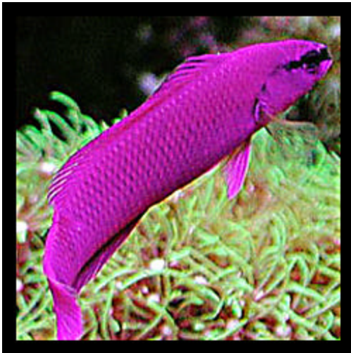
THE ORCHID DOTTYBACK (PSEUDOCROMIS FRIDMANI)

Look closely at the photo above! Though the color looks the same, the Purple Pseudochromis is much different in many ways from the orchid dottyback pictured here. Orchid dottybacks are one of the mildest mannered of the Pseudochromis group. This intensely colored fish seldom attacks shrimp and gobies compared to the evil Purple Pseudochromis that can become a plague in the reef tank. Orchid dottybacks also maintain their vivid color even as an adult. The group we currently have at the store are tank bred and in perfect condition. Tank bred specimens are hardier and tend to be more tolerant of smaller gobies and blennies. These fish eat a variety of foods from flakes to frozen meaty foods. Reaching only about 3"-4" at full size, the orchid dottyback is a long-lived hardy marine fish, even for beginners. This is just one of the specials this week at Tideline Aquatics. Print off the coupon at: www.tidelineaquatics.net