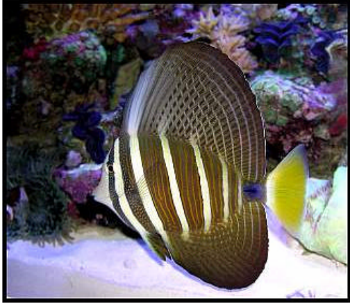
ADULT SAILFIN TANG (ZEBRASOMA VELIFERUM)

The common Sailfin Tang is one of the hardiest of the surgeonfish. As long as you regularly monitor your pH and KH (carbonate hardness) and keep up with your monthly partial water changes, this fish will be with you for years. As with most of the Zebrasoma tangs (Hawaiian Yellow, Red Sea Purple, Fiji Scopas), the Sailfin Tang will become territorial toward any new fish added to the aquarium. This is easily overcome by simply separating the tang from the new fish for about 24 hours. This allows the new fish to establish territory so it will stand up to the established Sailfin Tang. This does not always happen, but it is common with many tangs. As with other surgeonfish, the Sailfin Tang also requires supplemental algae foods in their diet. Dried marine algae, macro-algae and even frozen romaine lettuce will all work well. It is also a good idea to ensure your aquarium is grounded properly to prevent the development of head and lateral line erosion. This is just one of the specials this week at Tideline Aquatics. Print off the coupon at: www.tidelineaquatics.net