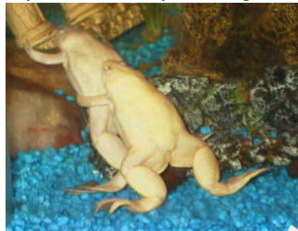
ALBINO CLAWED FROG PARTY ( XENOPUS LAEVIS )

Regular clawed frogs and the albino clawed frogs are the biggest attention getters. These frogs have what appear to be muscular legs and rounded fat bodies. Though these frogs are extremely hardy, they also grow very large (about hand-sized)!! As they grow, their appetite grows. Instead of eating sinking pellets, they being swallowing up any small fish they can drag into their mouths.