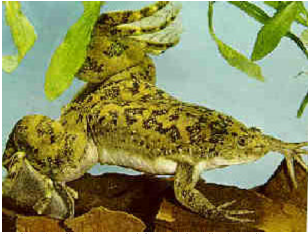
REGULAR CLAWED FROG (XENOPUS LAEVIS)

Often the owner does not realize what is happening to their fish as the frogs are hunting them down at night as they rest upon the bottom of the aquarium! Regular clawed frogs and Albino clawed frogs are best kept with larger fish. Gouramis, Silver Dollars, Geophagus, Larger Bala Sharks all make good companions as they are too large or too difficult to swallow. For aquariums with smaller fish, the Dwarf African Frog is the answer. These frogs seldom grow larger than 1.5” and do not try to hunt down its tankmates as a snack. Sinking pellet foods suit these dwarf frogs just fine making them excellent choices for aquariums containing smaller fish. Dwarf frogs are easily distinguished from the regular Clawed Frogs. Dwarf frogs have pointed heads, heavily flattened bodies and skinny long legs. Regular Clawed frogs look more like small body builders pumped up on steroids. Fat stocky legs, black rear claws, plump bodies and rounded heads are all characteristic of regular clawed frogs. Don't make a mistake! Your aquarium population will begin to decline often the very first night!