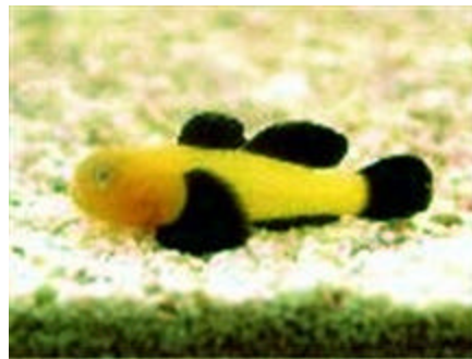
THE PANDA GOBY (PARAGOBIODON LACUNICOLUS)

This fish is available irregularly but it is one of the most unusual of the hardy marine fish. Tassled filefish almost appear furry with long appendages covering its entire body. These fish enjoy an omnivorous diet (both meaty and vegetable based). This fish must be kept with relatively peaceful species to prevent them from being damaged. This group is about 2.5" long but they can reach about 7" long in the aquarium.