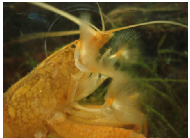
THE VAMPIRE SHRIMP (ATYOPSIS GABONENSIS)

This interesting brackish water goby is indigenous to Sri Lanka, Malaysia, Papua New Guinea and Indonesia. As with other brackish water fish, raising and lowering of the salinity does not harm this fish as long as it is done gradually. This fish will likely NOT accept flake foods at first preferring frozen meaty foods and live worms in their diet. Avoid keeping this peaceful goby with any aggressive eating fish as they are quite shy and similar to the feeding habits of Bumble Bee Gobies. R. balteatus reaches about 2" long, will thrive in pH levels of 7.0-8.0 with a general hardness of 10-20 degrees for best results. To be so interesting, this is an inexpensive new arrival!!!