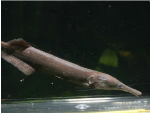
ELONGATED ELEPHANTNOSE (OXYMORMYRUS BOULENGERI)

This is the first time that Tideline Aquatics have EVER been able to obtain this rare elephantnose from the middle Congo Basin of Africa. We have been able to find little to no information on the care of this species but we are betting the care is similar to other Moryrids. These fish are electrogenic; produce an electric field to maneuver through their environment and to locate food items. It is best to keep only one electrogenic fish per aquarium as they tend to constantly chase one another causing stress to both fish. These fish are completely safe with small peaceful fish that will not outcompete this incredibly intelligent group of fish for food. This fish is NOT a flake food eater. At first, it should be offered live black worms. Then once established, one can start mixing in frozen foods like bloodworms, brine shrimp and mysis. The aquarium must be covered to prevent these fish from jumping out of the aquarium. Moryrids also need an aquarium that is well planted (live or artificial plants) with caves and crevices to give this fish some refuge. Did we mention intelligent? Mormyrids have the largest brain to body weight compared with all other species (including you!). These fish arrived in rough