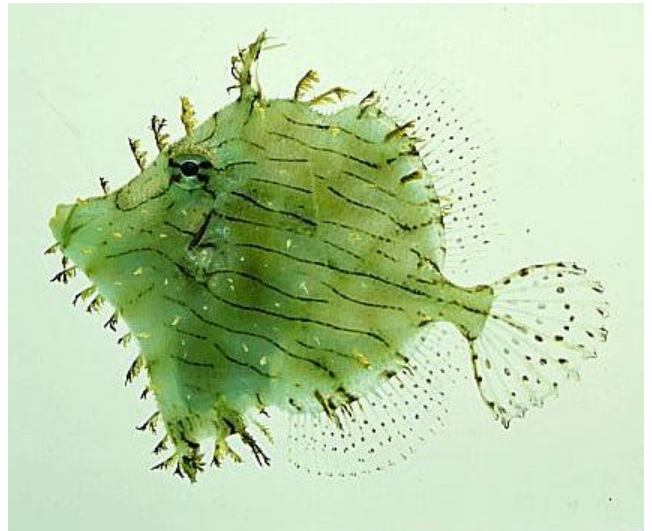
THE TASSLED FILEFISH (CHAETODERMA PENCILLIGERA)

peaceful compared with most other triggerfish species even after they reach full size. This is also an extremely hardy fish for the aquarium. Housing these fish with larger gobies, blennies, dwarf angelfish, butterflyfish and tangs should be no problem. These fish are somewhat nervous when first introduced but overcome their fear once established. This triggerfish enjoys a meaty diet mixed with vegetable type foods like dried marine algae.