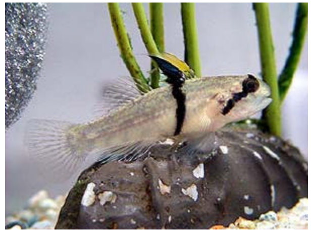
FRESHWATER CLOWN GOBY (REDIGOBIUS BALTEATUS)

condition with quite a bit of fin damage. Anyone interested in these fish should just place a deposit on one and allow us to get them healed up from the long trip from Africa. We also want to get them feeding well before you take one home!