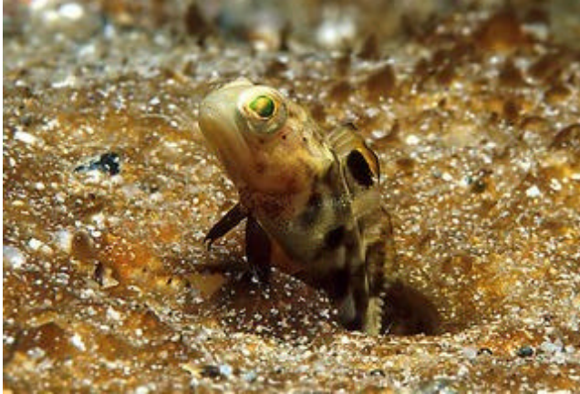
THE BULLSEYE JAWFISH (?) (OPISTOGNATHUS SCOPS) (?)

There are so many interesting Jawfish available in the marine fish trade but this one is brand new to us! They arrived about 10:30pm and do appear to be close to the fish pictured above. BUT these are from Bali, Indonesia and not from the Baja of California as the true Op. scops pictured above is native. As with all jawfish, they love to dig tunnels all over the aquarium where they poke out their heads waiting for the next meal!