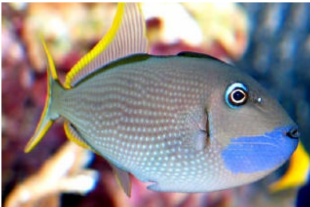
BLUEJAW TRIGGERFISH PAIR!! (XANTHICHTHYS AUROMARGINATUS)

There are so many interesting Jawfish available in the marine fish trade but this one is brand new to us! They arrived about 10:30pm and do appear to be close to the fish pictured above. BUT these are from Bali, Indonesia and not from the Baja of California as the true Op. scops pictured above is native. As with all jawfish, they love to dig tunnels all over the aquarium where they poke out their heads waiting for the next meal!