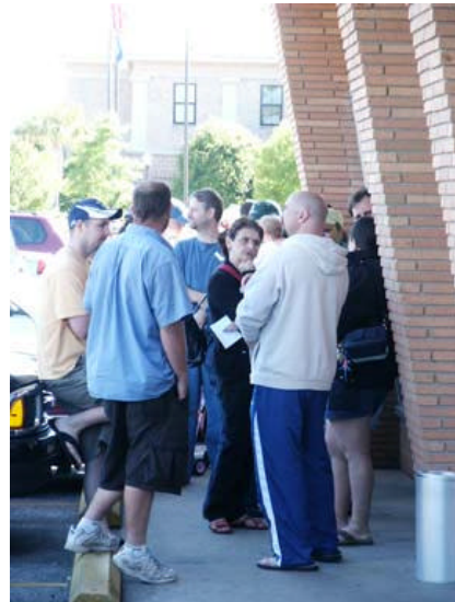
THE FIRST IN LINE – A TRADITION FOR SOME!

numbers for all of the super give-a-way prizes – all of which were notified that afternoon. Congratulations to all of the winners!