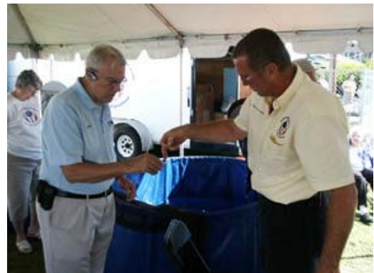
SHOWA KOI CLUB MEMBERS GETTING READY!