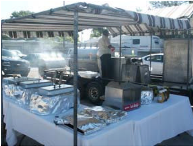
SOUTHERN BROS. BBQ GETTING THE FOOD READY!

We wanted to give special thanks to the following people for all of their help: