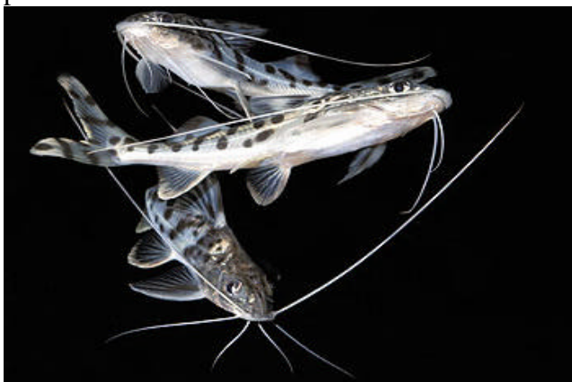
POPULAR PICTUS CATFISH – AS THEY GROW THEY WILL EAT SMALL FISH (SEE THE MOUTH POINTS FORWARD).

With so many exciting catfish in aquarium stores, so often the wrong type of catfish is added to a freshwater aquarium. You can easily distinguish the problem catfish from the more peaceful catfish.