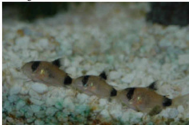
A LINE UP OF CORYDORAS PANDA CATFISH!

Most corydoras catfish species are extremely hardy, enjoy living in groups of two or more, often breed in the aquarium and are the perfect scavenger of uneaten food.