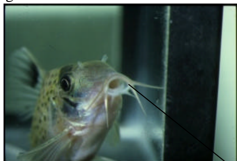
A HEALTHY CORYDORAS CATFISH WITH NO SIGN OF DAMAGE TO ITS MOUTH BARBELS.

Corydoras catfish enjoy soft water with a temperature range of 76-85 degrees making them the perfect catfish for most community aquariums. If you choose to keep a large group of these catfish, supplement their diet using sinking type pellets designed just for small catfish. If your water is hard, it can lead to problems with corydoras. Symptoms can include receding fins and/or eroded mouth barbels.