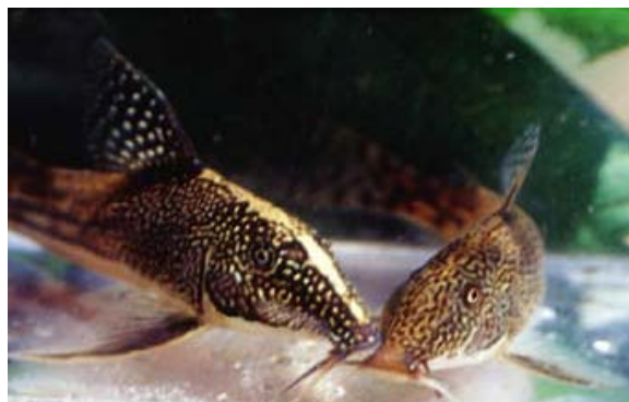
RARE & EXPENSIVE CORY. BARBATUS CATFISH

Fine gravel, sand or smooth larger gravel will also protect corydoras catfish from having their barbels damaged while they rummage through the substrate in search of food.