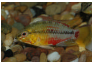
APIST. MACMASTERI REDNECK