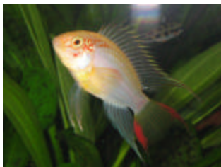
APIST. VIEJITA GOLD