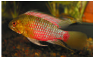
APIST. HONGSLOI II