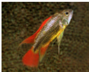
A. CACATOIDES DB ORANGE