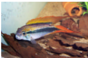
APIST. AGASSIZI ORG-RED