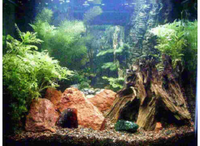
DRIFTWOOD AND SIMPLE ROCK FORMATIONS ARE THE FOCAL POINT OF THIS AQUASCAPE DESIGN

aquarium designs. Like gardening, viewing others designs can open your mind to creating your own unique aquarium picture in your home.