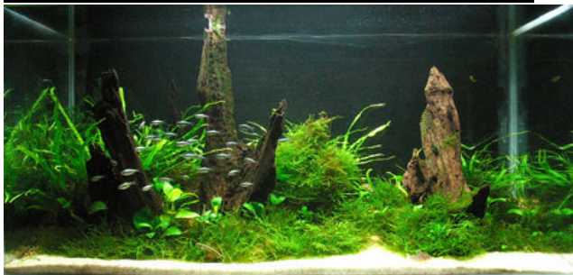
DRIFTWOOD ROOTS TOWERING ABOVE LIVE PLANTS

The decorating of an aquarium is referred to as Aquascaping. Consider your aquarium a blank canvas for you to create your best piece of art. Construct a focal point (and it does not have to