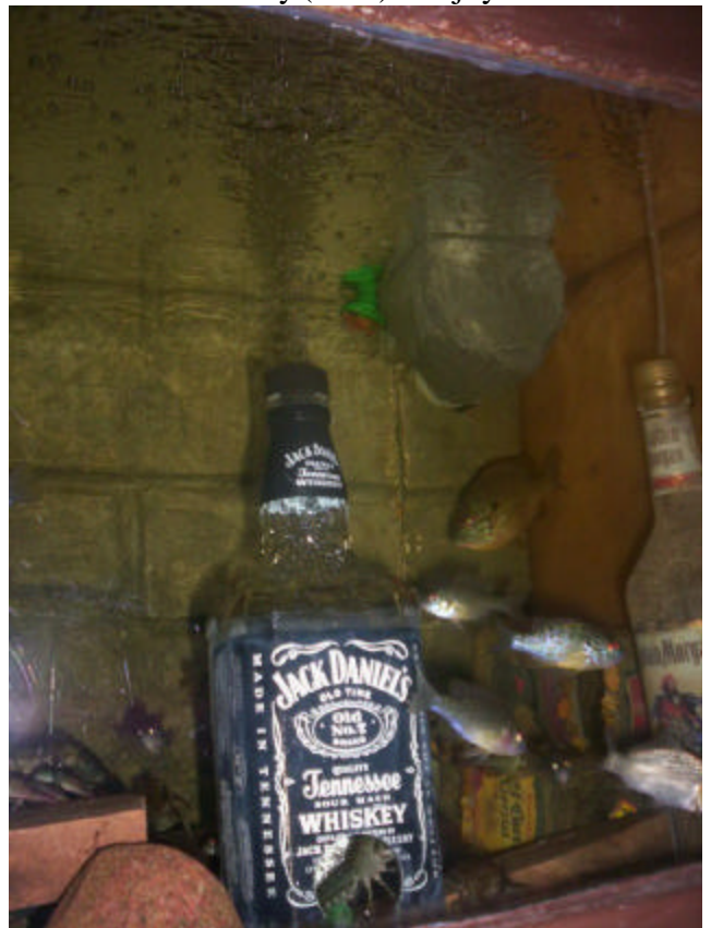
GOOD OLE BOY AQUASCAPING LOL!!