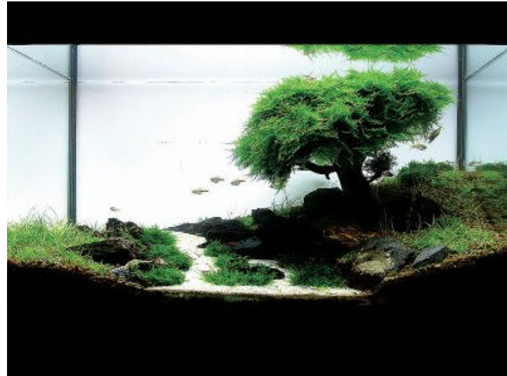
JAVA MOSS GROWN ON THE TOP OF A DRIFTWOOD BRANCH CREATES A SPECTACULAR UNDERWATER BONSAI TREE

be in the center of the aquarium) whether it be made of driftwood, decorative coral, a rock formation or even just a grouping of live or artificial plants.