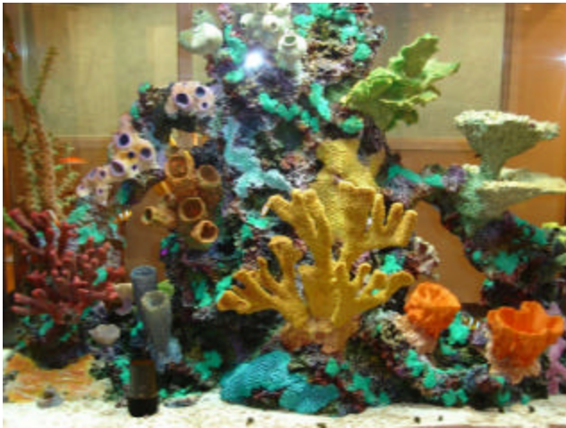
COMBINATIONS OF DECORATIVE CORAL WITH HIDING PLACES AND HOLES FOR THE FISHS COMFORT

For a unique freshwater design, use a branching piece of driftwood as a center piece. Tie on a hardy plant like Java Fern on the ends of the driftwood. Once the plant roots embed into the wood, trim the Java Fern to keep it growing on the ends of the wood creating a tree-like affect. If you do not want to use live plants, create a driftwood or rock centerpiece and compliment it with short artificial plants of the same variety grouped in areas around and within the rock and driftwood.