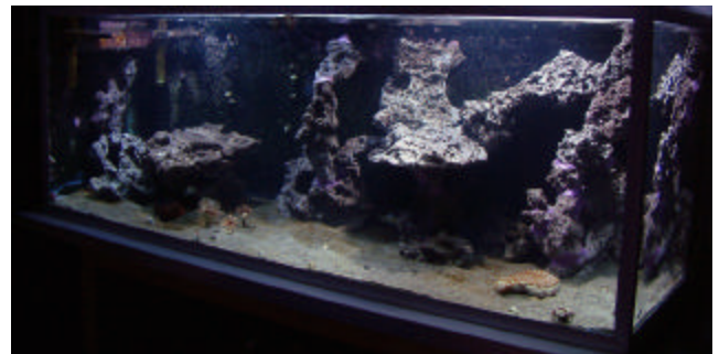
LACE ROCK STACKED TO DRAW YOUR ATTENTION TO THE OVER-HANGING CLIFF AND CAVE

After choosing your focal point, then select additional aquarium décor to compliment your focal point, not draw your attention away from it. Do not be afraid to be creative in your aquarium. Dream up aquascaping designs that fit your idea of art as well as making your fish and/or invertebrates feel safe and secure in their artificial environment.