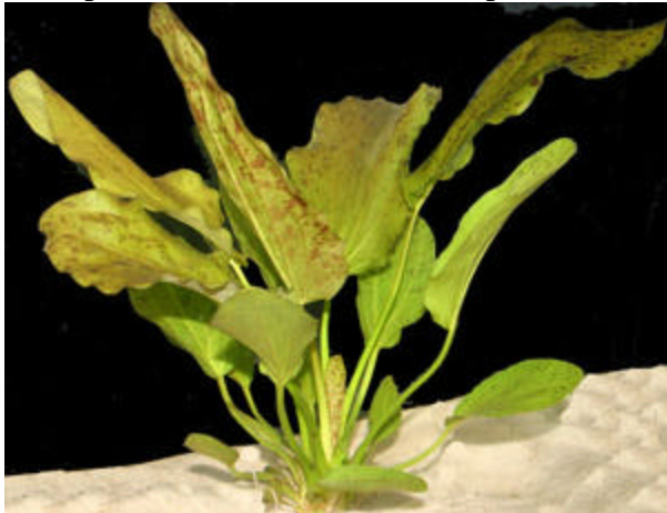
EMERSED FORM OF THE OZELOT SWORD

Though the common Amazon Sword Plant will never lose its popularity, there are vast hybrid sword plants that are quite stunning and similarly hardy. This week we received a shipment of the lightly variegated Ozelot Sword Plant. These plants were grown above water (emersed grown) at the nursery and the emersed leaves are not as variegated as the new submersed leaves that will soon sprout from these fine sword plants.