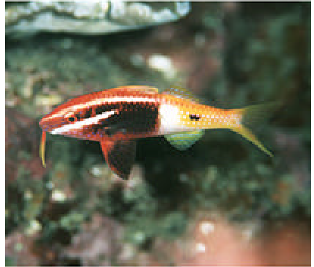
THE BICOLOR GOATFISH CRUISING ABOUT....

Marine fish hobbyists are always on the look-out for a schooling fish for their aquarium. Goatfish are an excellent choice if you have a relatively peaceful aquarium. In fact, the goatfish rarely leaves any morsel of fish food behind as after the main feeding, they spend the remainder of the day in search of missed food items using their “nanny goat-like” apparatus just below the mouth. Goatfish are always moving meaning they burn up lots of energy every day. For that reason, ensure they get plenty of food, preferably being fed at least twice per day. Goatfish are safe with all but the smallest of fish and do not harm live corals BUT will eat small shrimp.