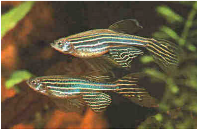
LONGFIN ZEBRA DANIOS

Anyone that has had an aquarium has likely housed a Zebra Danio at some point or another. Considered one of the hardiest of all freshwater fish, the Zebra Danio will always be popular. But this fish almost makes you dizzy watching dart all over the surface of the aquarium and even can intimidate more shy species. Enter the Longfin Danio! Now this is a stunning little danio with elongated lacy fins that are not nipped by one another. The longer fins also slow the fish down so it is less nervous looking in the aquarium. As with the standard zebra danio, the longfin hybrid is still as tough as nails surviving even in less than perfect water conditions.