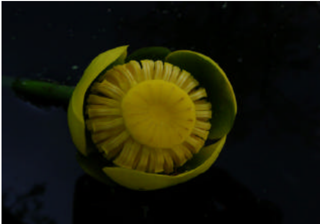
SPATTERDOCK FLOWERS IN OUTDOOR PONDS

Spatterdock forms are found from Japan to North America and are fairly hardy plants if offered a rich substrate and care is taken when planting. The stem of this plant is susceptible to rotting if it becomes bruised. If this does occur, using a clean sterile sharp knife or razor and cut the stem about 1" above the damaged area then gently plant it into a soft substrate. This plant will also survive outdoors in the garden pond where it forms lily-like floating leaves and eventually the stunning flower pictured below. In the aquarium, it will not flow or form floating leaves instead developing the pale green translucent leaves pictured earlier.