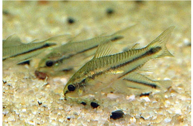
FEEDING PYGMY CORYDORAS CATFISH

This is the tiniest of the Corydoras catfish (only about 1/2" long). If you have a community aquarium that houses only small fish, you have the perfect environment for the Pygmy Cory Catfish. Like other Cory Catfish, we suggest keeping them in pairs or more. Digging around for uneaten fish food in the most minute places, the Pygmy Cory Catfish is always in search of food. They also move through the plants and decorations searching for food left behind by the other fish.