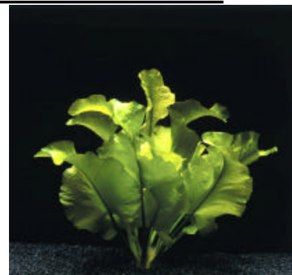
SPATTERDOCK NUPHAR SPECIES