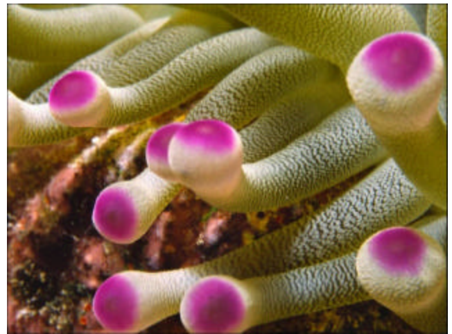
THE PINK-TIP CONDYLACTUS ANEMONE

As you know, anemones can be difficult to keep but the Caribbean Condylactus Anemone is one of the hardiest of the anemones as long as the foot is not damaged (always view the foot for damage when purchasing any anemone). Most Caribbean anemones will not host a clownfish but for whatever reason, the Pinktip Condy seems to be accepted by Maroon Clowns and Sebae Clowns! These anemones are photosynthetic meaning they must be provided with reef lighting in order for the algae in the tissue to thrive. Feed these anemones about 2-3 times per week a meaty frozen food. Like all anemones, the Pink Tip Condy will move about the aquarium until it finds a suitable place (often near good water flow). All anemones can eat fish if a fish darts into the anemone so be aware of this possibility. Marine fish have a natural instinct to stay away from anemones but if spooked, the fish may inadvertently dart into the anemone and be eaten.