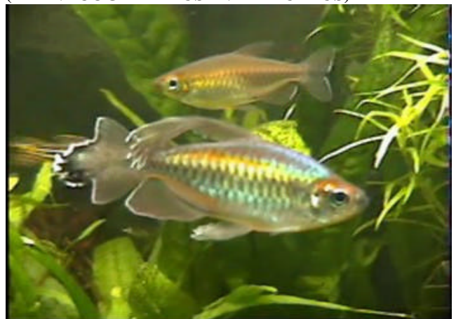
SUPER MALE CONGO TETRA (FEMALE IN BACKGROUND)