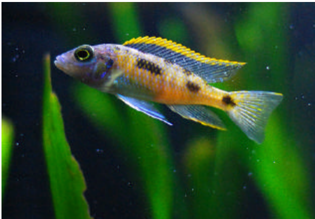
SUB-ADULT MALE LITHOBATES CICHLID

This Lake Malawi African Cichlid is a rarity at Tideline Aquatics but we were fortunate to have