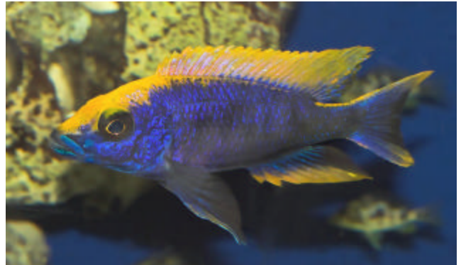
ADULT MALE LITHOBATES CICHLID

a customer that breeds these incredible fish locally. Like all cichlids from Lake Malawi, the Lithobates cichlid prefers alkaline water with a pH of 8.0-8.6. The Lithobates is a mid-water swimmer that is not too hateful and thrives with other less aggressive cichlids like peacock cichlids, venustus cichlids, livingstoni cichlids, yellow labidochromis and the like. We currently have 3" sub-adults that are all males. As this fish matures, it develops the striking colors pictured below.