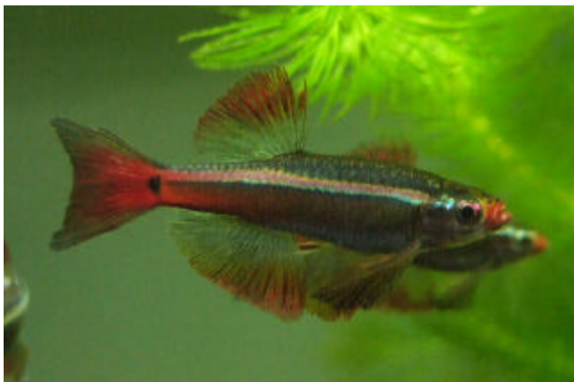
ADULT LONG-FIN WHITE CLOUD MOUNTAIN MINNOWS Longfin White Cloud Minnows prefer to be in groups of three or more. This fish schools in the upper areas of the aquarium and is the perfect community fish. In our area, this fish even survives outside year round if introduced in the

The hardy White Cloud Mountain Minnow has been an aquarium favorite for many years. Well now this beauty has been hybridized to a long-fin version. We have a large number of developing sub-adults that are loaded with red color. This longfin minnow is grown out quickly at fish farms so the body grows out before all of the long fins fully develop. As they matures in age, the fins grow out to the beautiful specimen you see below.