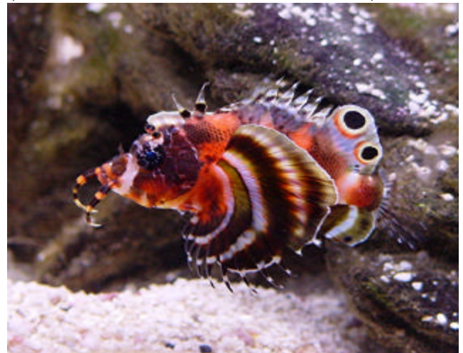
THE FUMANCHU LIONFISH