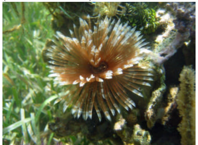
AN ESTABLISHED FEATHER DUSTER WORM

Displaying this delicate looking feather-like apparatus, tubeworms make a beautiful addition to an invertebrate aquarium. Below the beauty actually lies a not so pretty worm clothed in a