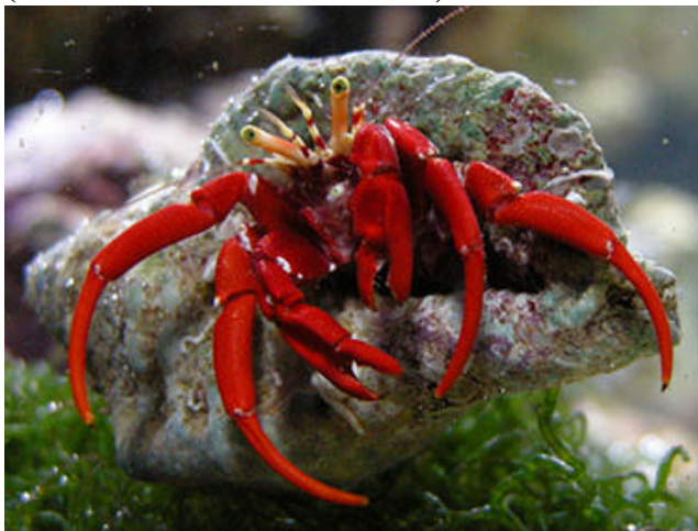
THE SCARLET RED LEG REEF HERMIT CLOSE-UP

This picture makes this Scarlet Reef Hermit appear huge but actually they are only about 1” long! These hardy algae grazing reef hermits are completely reef safe. As with all hermit crabs, offer them empty shells to move in to as they molt and grow. If not, they will rip your snails out of their shells and make themselves a new home! Many books also list these hermits as eating Cyanobacteria (slime algae) but we have not seen much of this actually occurring. We recommend this beautiful reef hermit for filamentous algae control.