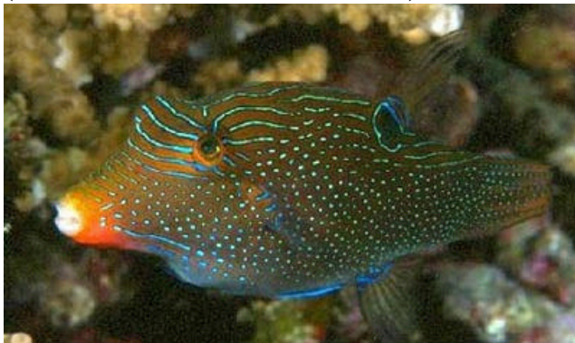
THE BEAUTIFUL BLUE SPOT SHARPNOSE PUFFERFISH

Just about everyone loves pufferfish but many just grow too large for smaller aquarium. But there are many dwarf pufferfish (3"-4") often referred to as Sharpnose Pufferfish. The peaceful Blue Dot Sharpnose Pufferfish is one of the prettiest of the dwarf pufferfish. Unlike the bold eating machines many large pufferfish become, sharpnose puffers are mild, slow moving fish that are equally hardy once established. Sharpnose Pufferfish prefer meaty foods combined with some vegetable matter on occasion. The beak-like tooth on pufferfish can over grow if you do not offer your puffer some hard foods like tiny fiddler crabs or small hermit crabs which can prevent the "tooth" from over growing. If you have a smaller aquarium and want a puffer, give one of these beauties a good home.