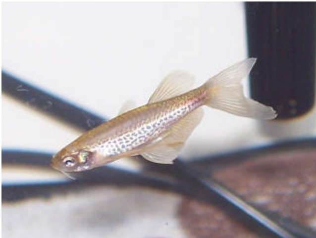
LONGFIN LEOPARD DANIO

Anyone that has had an aquarium has likely housed a Zebra Danio at some point or another. Considered one of the hardiest of all freshwater fish, the Zebra Danio will always be popular. But this fish almost makes you dizzy watching dart all over the surface of the aquarium and even can intimidate more shy species. Enter the Longfin Danio! Now this is a stunning little danio with elongated lacy fins that are not nipped by one another. The longer fins also slow the fish down so it is less nervous looking in the aquarium. As with the standard zebra danio, the longfin hybrid is still as tough as nails surviving even in less than perfect water conditions.