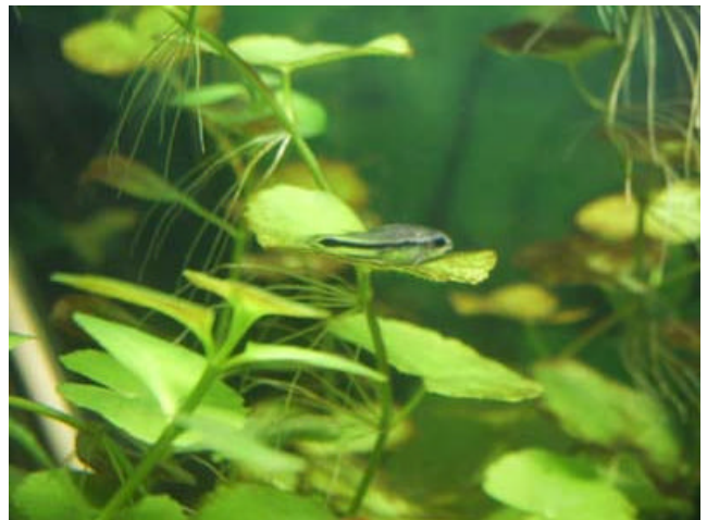
FULL SIZE PYGMY CORY CATFISH PERCHED ON A SINGLE PLANT LEAF!

This is the tiniest of the Corydoras catfish (only about 1/2" long). If you have a community aquarium that houses only small fish, you have the perfect environment for the Pygmy Cory Catfish. Like other Cory Catfish, we suggest keeping them in pairs or more. Digging around for uneaten fish food in the most minute places, the Pygmy Cory Catfish is always in search of food. They also move through the plants and decorations searching for food left behind by the other fish.