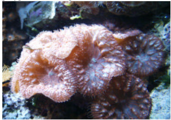
PINK BLAST. WELLSI FROM THE AUTHORS AQUARIUM

fed small pieces of mysis shrimp, brine shrimp and other finely chopped seafood, the coral will expand far from the skeleton forming flower-like polyps that are exquisite.