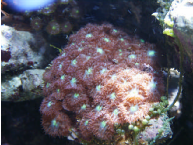
RED & GRN BLAST. MERLETI FROM THE AUTHORS AQUARIUM

My best description of Blastomussa merleti would have to be like a bouquet of long-stemmed flowers. While B. wellsi's skeleton grows level with the rock, Blastomussa merleti grows on elongated stem-like skeletons. As each polyp expands, it forms tight groups resembling flowers. B. merleti accepts the same care and is similar looking to B. wellsi but the polyps are smaller. This coral is also found in several color combinations but the one pictured above is most frequently encountered in our hobby.