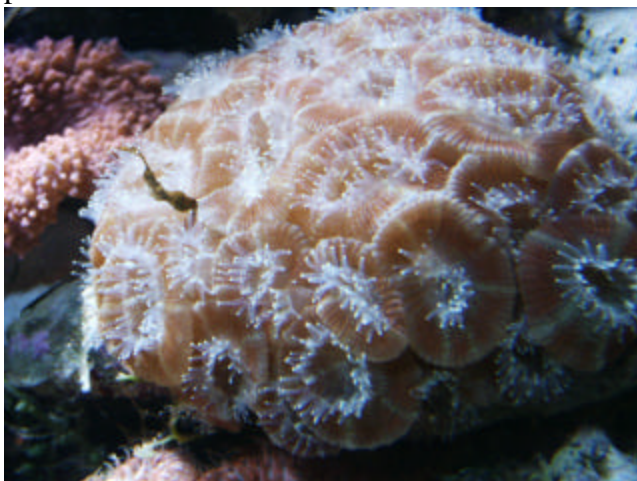
A LARGE PINK ACAN. FROM THE AUTHORS AQUARIUM

Due to the expensive cost of large colonies of Acanthastrea coral, most often you will find these in “frag” sizes. Though they may be small, this coral multiplies rather quickly, especially if fed regularly. To prevent small frags from being knocked off rock or carried away by other reef inhabitants, we suggest using a coral glue or aquarium safe underwater epoxy. Not only will this protect your coral frag, it will allow the coral to become established more quickly and multiply without the danger of falling face down and suffering damage that sets back its growth potential.