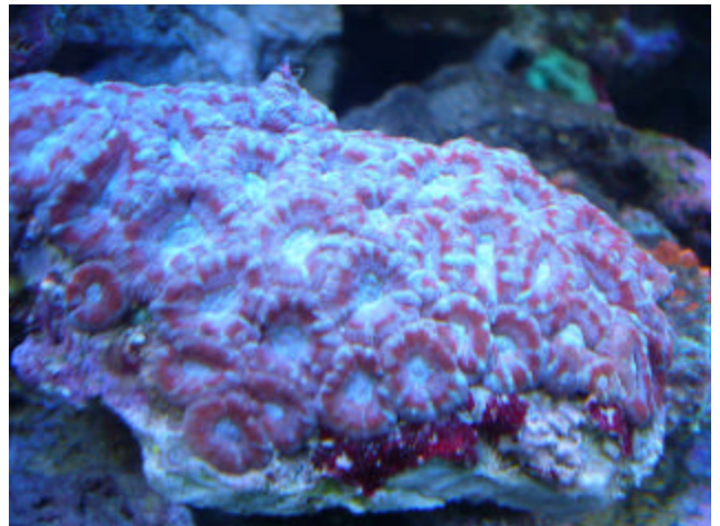
INTRODUCED ONLY A WEEK AGO, THIS LARGE ACAN. COLONY IS ALREADY COLORING UP IN CHEYENE FROM TIDELINE'S HOME AQUARIUM!