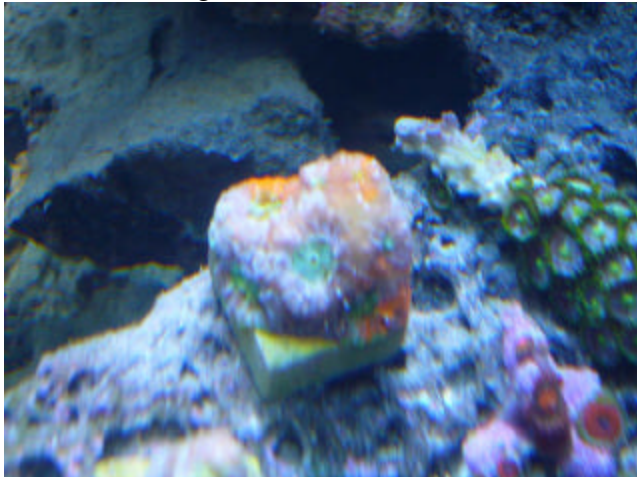
A LOVELY ACAN. FRAG (ABOUT 1' AROUND) FROM CHEYENE AT TIDELINE'S HOME AQUARIUM.

Like Blastomussa corals, Acanthastrea corals respond well to being fed about three times per week (more if you keep up with your partial water changes). Even when not being fed, this coral expands its polyps appearing like colorful buns in a baking dish.