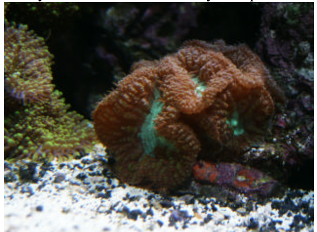
GREEN & RED BLAST. WELLSI FROM THE AUTHORS AQUARIUM

Within months, you will see small ‘buds’ form on the side of the larger polyps that eventually form new heads. If fed about three times per week and given good water quality, you will soon have a much more valuable and striking colony of Blastomussa wellsi in your aquarium.