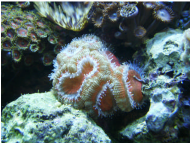
PINK & GREEN ACANTHASTREA COLONY FROM THE AUTHORS AQUARIUM

We often refer to Acanthastrea corals as the surprise coral. Most often, they arrive quite dull in color from the wild yet within weeks of being under medium to low reef lighting conditions, each one blooms with bright new color! This is another coral that just does not show well until it becomes accustomed to its new aquarium.