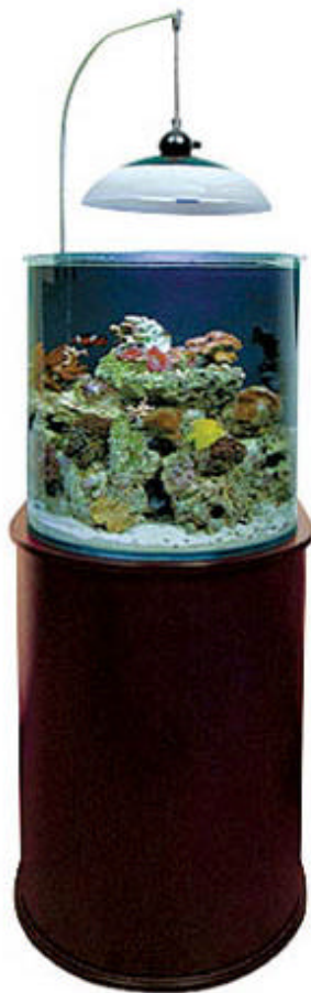
THE CURRENT USA CARDIFF AQUARIUM PACKAGE

THE TIDELINE AQUATICS CHRISTMAS AQUARIUM GIVE-A-WAY FOR 2009!!