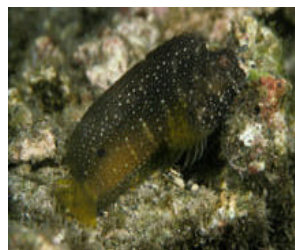
STARRY ALGAE BLENNY