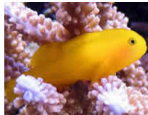
YELLOW CLOWN GOBY