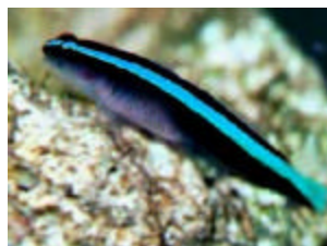
BLUE NEON GOBY