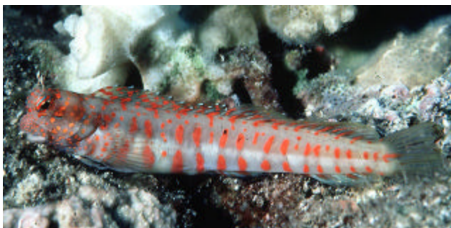
ORANGE SPOTTED BLENNY