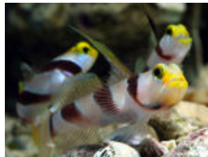
CANDY CANE GOBY

gobies that dig out a home in the substrate similar as with jawfish. Most gobies are extremely hardy and completely at home in the reef aquarium. So many customers don't purchase many goby species for fear they will not see them but be aware that once these fantastic fish become established, you will see them daily moving about the aquarium. Most gobies accept all types of foods from flake to frozen. Always ask a staff member to assist you on the proper food for the goby you purchase. We have pictured some of our favorite gobies that are well within the budget of most hobbyists.