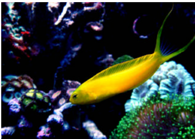
YELLOW CANARY BLENNY

So when you are considering adding a new fish to your reef aquarium, always stop and get all the information needed for you to make a smart decision. Is this fish safe to keep with shrimps and crabs? Is this fish prone to picking at corals? Is this fish likely to become aggressive over time? Is this a disease prone fish? Does this fish require special feeding? How large does this fish grow? Will this fish be compatible with the other species in my aquarium? These are all questions you should consider before purchasing a new fish for the reef aquarium. Once a fish is added to an aquarium loaded with live rock, it is not an easy task to remove them!! Make the right decision based on good information from your local aquarium store that you trust, Tideline Aquatics.