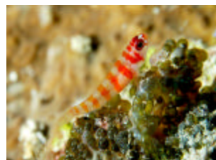
STRIPED TRIMMA GOBY