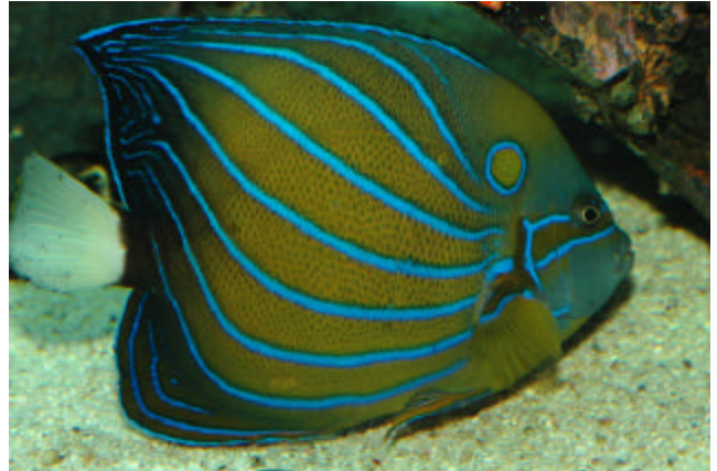
ADULT ANNULARIS ANGELFISH COLORATION

territorial but they are for the most part considered a community species. This angelfish is not reef safe.