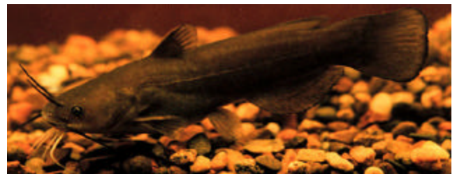
BABY BULLHEAD CATFISH