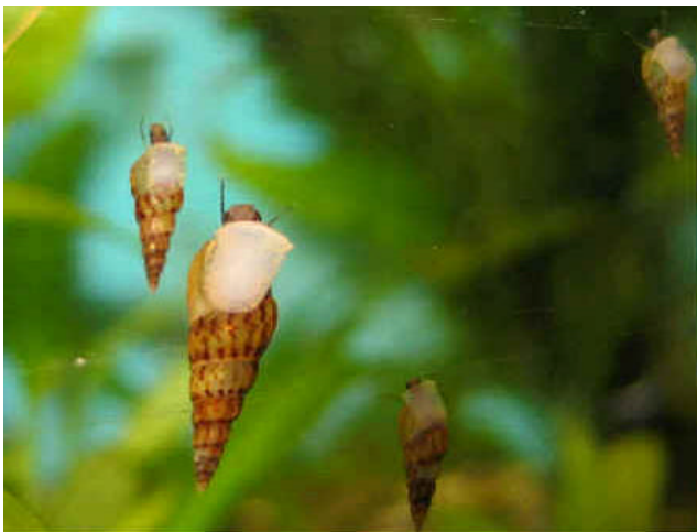
MALAYSIAN TRUMPET SNAILS - FRESHWATER