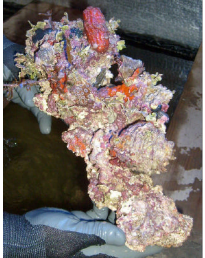
JUST AN EXAMPLE OF THE QUALITY OF PREMIUM AQUA-CULTURED CARIBBEAN LIVE ROCK!

arrive this Friday. We also have some other goodies coming with this shipment (secret!). If you did not get a chance to see this rock from our first shipment, get to the store and take a look at this new shipment.