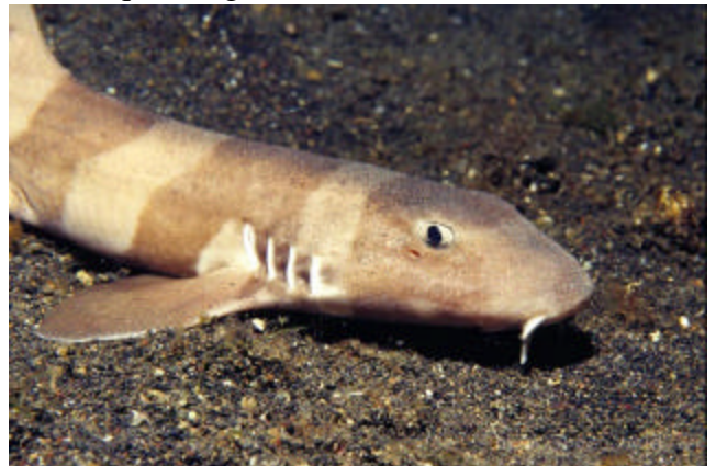
BOLD COLORS FADE AS THE SHARK MATURES

designed for aquarium fish. As a treat, you can offer your newly hatched shark small grass shrimp as well. Never feed your marine shark goldfish or other freshwater "feeder" type foods. It can take up to 7 days for a newly hatched shark to begin feeding but most often 2-3 days is the normal time frame. Don't overfeed the shark but instead offer 2-3 small chunks of food daily and increasing the amount as the animal grows. Though the shark is only about 5"-6" long when it hatches, it can grow about 12" per year! As your shark matures, the dark black stripes will fade to a more grey color. As an adult the stripes will be quite vague.