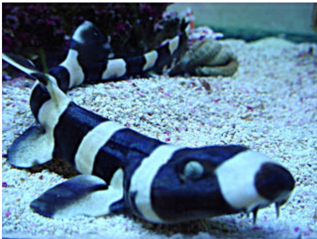
A BRIGHTLY COLORED HATCHLING!

Depending on the age of the egg capsule, you may see a 1"-2" shark moving about inside with a yolk sac attached or you may see a 4" fully formed shark inside. The size of the shark inside the egg capsule will give you an idea about how long it will be before the shark emerges from the egg. You should acclimate the shark egg capsule just as you would any other marine fish using either drip acclimation or by floating the bag and adding small amounts of water over a 1-2 hour period. The egg capsule should be handled gently and placed inside the aquarium quickly. Turn the egg gently from end to end to ensure that no air has been allowed to remain inside the egg capsule. The egg capsule should be suspended off the bottom of the aquarium using either a vegi-clip (attached to just a small corner tip of the capsule) or inside a mesh cage that allows excellent water flow around the egg capsule. Once you've placed it in the aquarium, regular handling should be avoided! Depending on the development of the shark embryo when you purchased it, it may take weeks (12 weeks or more) to hatch. You will see the shark growing larger and the egg sac shrinking smaller. When it comes close to hatching time, the shark will dart about inside the egg capsule until it breaks free ON ITS OWN. Don't try to release the shark because you believe it is stuck inside as this will cause harm to the shark.