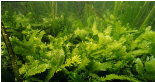
CAULERPA TAXIFOLIA INVASION