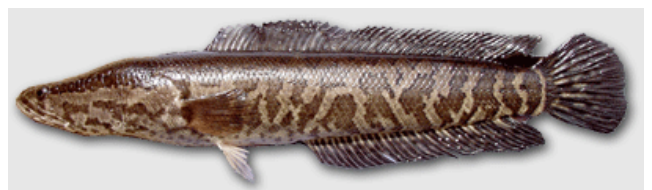
SNAKEHEADS BREEDING IN NY WATERS