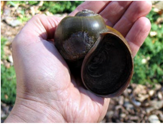
APPLE SNAILS IN SOUTHERN GEORGIA