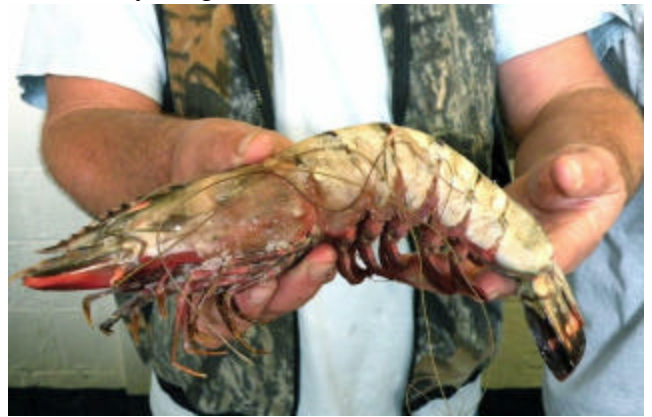
ASIAN TIGER SHRIMP CAUGHT IN BEAUFORT

YOU THINK would be beautiful in your local pond or lake but you could be causing a disaster! Non-native species can affect an entire ecosystem. Lionfish are now consuming small fish and invertebrates all over the Caribbean with nothing to stop them. The ramifications of this invasion are just starting to show up and the long-term damage is looking quite serious. Giant pacu found in waters from SC to Florida, acclimated Snakeheads eating all the fish in a pond, aquarium snails munching away at native plants in Georgia, non-native shrimp being caught in Beaufort....and the list goes on and on. If you have a creature, plant or invertebrate you no longer desire to own please bring it to us. We may not be able to issue you credit but we will accept it. This protects the environment and our aquarium hobby! Be responsible – NEVER release anything into our local waters!!!