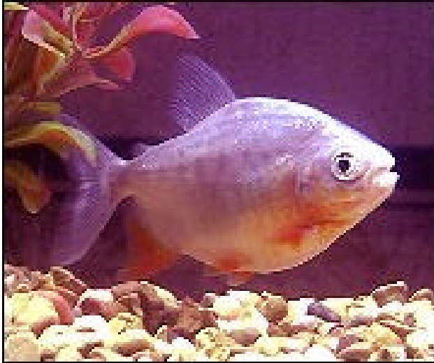
PACU CAUGHT IN WYOMING LAKE