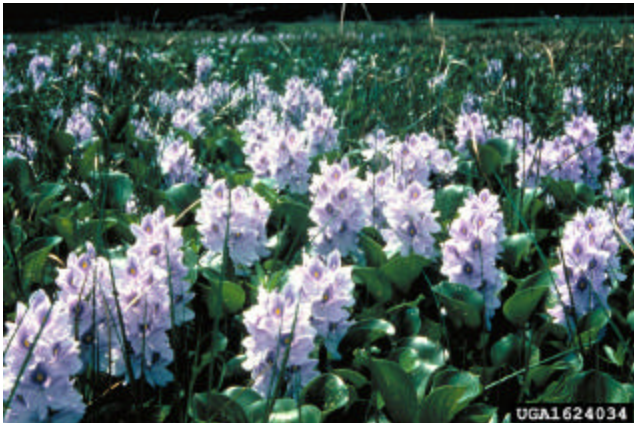
WATER HYACYNTH COVERING ENTIRE BODIES OF WATER IN THE SOUTHEAST