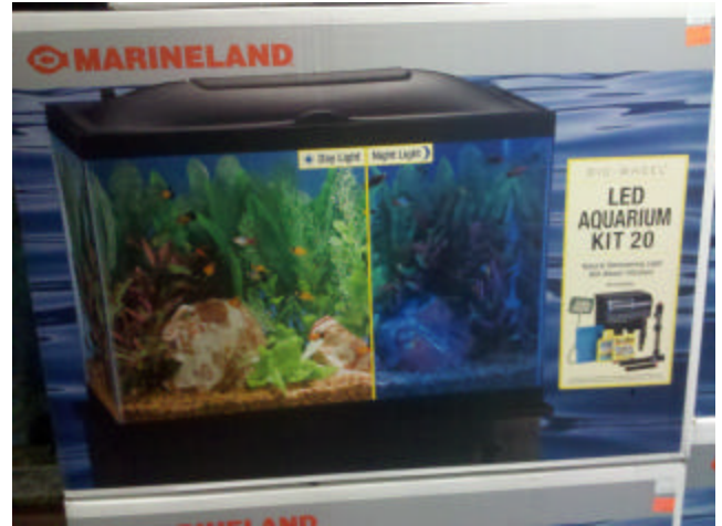
NEW AQUARIUMS WITH LED LIGHTING HOODS!!

Our first shipment of the new Marineland LED (light emitting diode) Aquarium Kits has arrived! Why LED you may ask? LED lighting uses very little energy, the lamps don't heat up your aquarium and the lamps last for over 10 years!! These LED hoods have both daytime and night lights included in each hood too... Each aquarium kit includes the tank, the low energy consumption LED hood, a quality biowheel power filter, water conditioner, fish food, fish net, a submersible aquarium heater and a thermometer. We have an incredible introductory price on these new exciting aquarium kits: