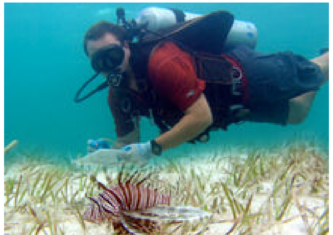
LIONFISH NOW IN THE BAHAMAS