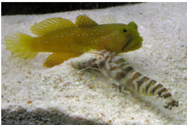
YELLOW WATCHMAN GOBIES PAIRED WITH TIGER PISTOL SHRIMP – ON COUPON THIS WEEK!!

WE RECEIVED SEVERAL OF THE NEW RED HEAD JAWFISH!! THESE JAWFISH HAVE A REDDISH HEAD WITH METALLIC GREEN BODIES! THEY ARE ALL EATING WELL AND WOW ARE THEY COOL! NO PHOTOS YET BUT WE ARE TRYING TO GET A GOOD ONE FOR POSTING!!