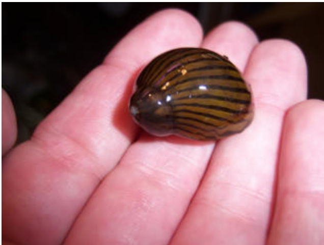
WE NOW HAVE FIVE VARIETIES OF THE FRESHWATER NERITE SNAIL. THESE ARE INCREDIBLE ALGAE EATERS THAT DO NOT REPRODUCE IN THE AQUARIUM. COMPLETELY SAFE FOR THE PLANTED AQUARIUM TOO!!