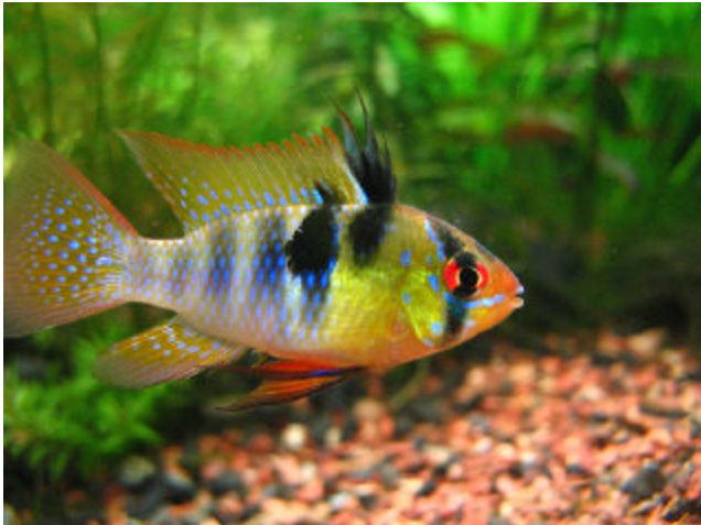
THE LARGE GERMAN BLUE RAMS THAT ARRIVED ARE FAT AND LOADED WITH COLOR FOR YOUR FRESHWATER AQUARIUM. THESE ARE PEACEFUL FISH THAT REQUIRE EXCELLENT WATER QUALITY.