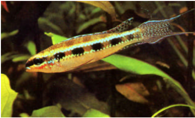
THE FILAMENTOSA DWARF CICHLIDS THAT ARRIVED ARE STUNNING. LOADED WITH COLOR AND ALREADY EATING WELL! PERFECT FOR THE PLANTED AQUARIUM AND INEXPENSIVE!