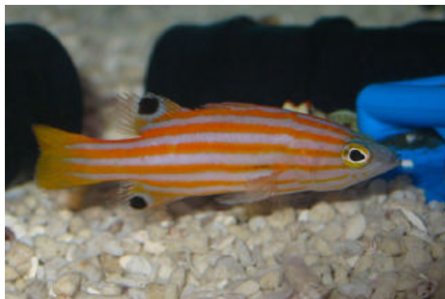
SWALE'S SWISSGUARD BASSLET – STUNNING COLOR

FROM AUSTRALIA THIS WEEK WE RECEIVED (2) OF THE SPECTACULAR BRIGHT PINK & ORANGE SYMPYLLIA WILSONI CORALS. THESE ARE EXPENSIVE BUT ABSOLUTELY WONDERFUL AND HARDY!