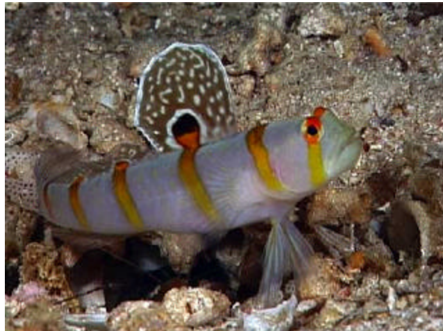
AN ADULT RANDALLI GOBY

For whatever reason this fantastic goby is often overlooked at the store. Perhaps it is that the juveniles lack some of the vivid color of the adult fish or that we just don't place them properly.