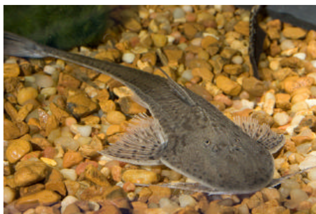
LORICARIA CIRCULAR CATFISH / ALGAE EATER