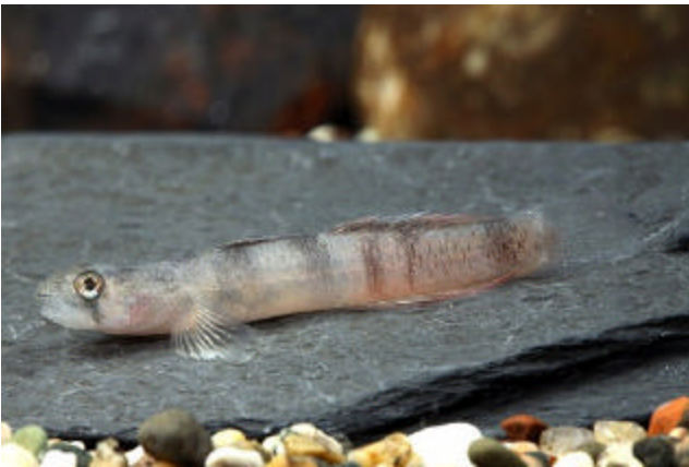
PAIRS OF REDBELT CLIMBING ROCK GOBIES!!