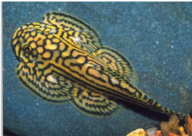
BUTTERFLY HILLSTREAM SUCKER LOACH

Our freshwater suppliers Segrest Farms and Sunpet had all sorts of cool freshwater fish this week. Here are some of our favorites that arrived: