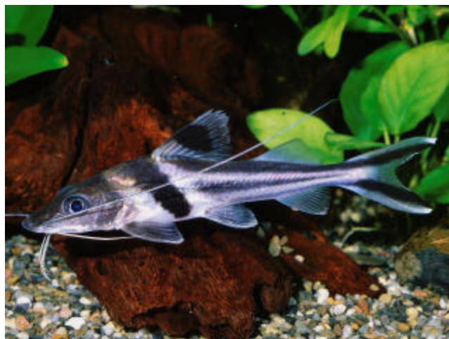
PIMELODUS ORNATUS CATFISH – AWESOME!!