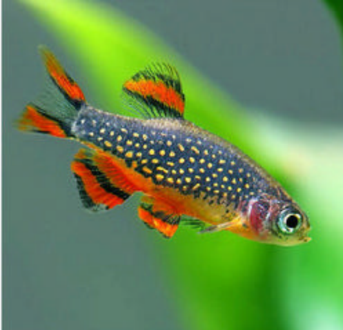
CAPTIVE BRED GALAXY RASBORAS!!