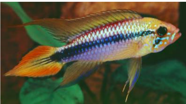
YOUNG MALE APISTOGRAMMA AGASSIZI DWARF CICHLIDS – THESE ARE IN AMAZING CONDITION!!