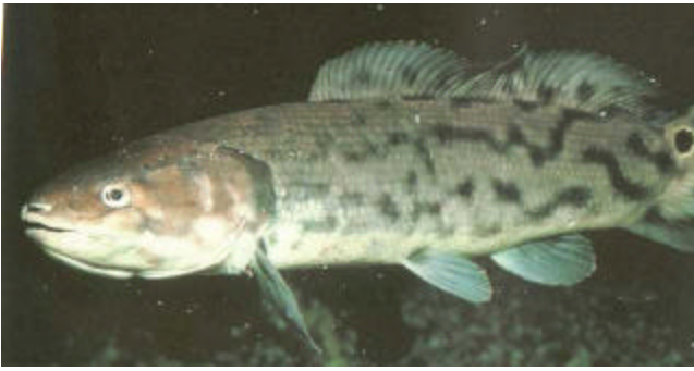
NORTH AMERICAN BOWFIN – YOUNG MONSTERS!